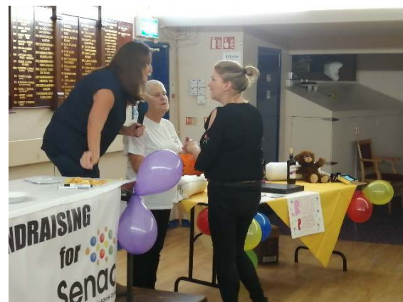
The evening included a Tombola and Raffle