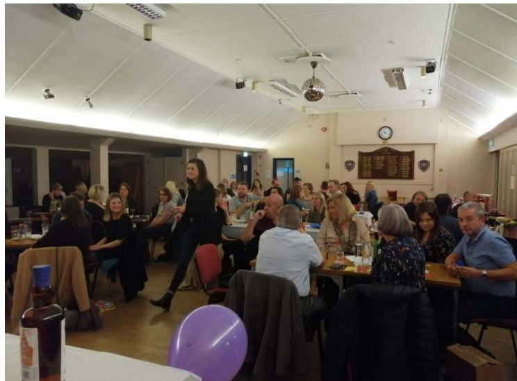
Almost 100 participants enjoyed the night's competition